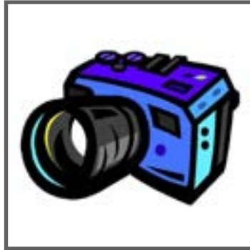
Senior Portraits/ Picture Day