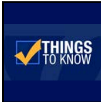
Important Things to Know