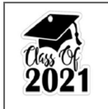
Class of 2021 Graduation News