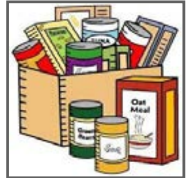
Comfort Closet/ Family Resources