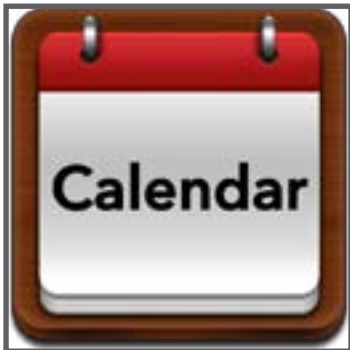
2020-21 & 2021-22 District Calendars

CLICK ON AN IMAGE BELOW TO JUMP TO THAT PAGE