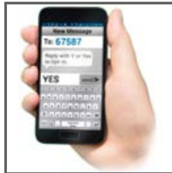
School Messenger Text Alerts