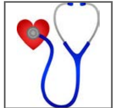
News from the Nurse