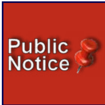
D214 Asbestos Notification