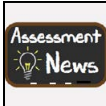
Assessment Center News