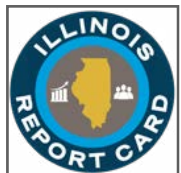
Illinois Report Card