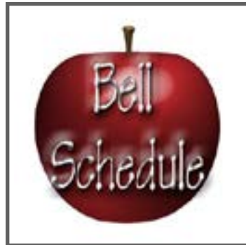
Blue/Orange Days & Bell Schedule