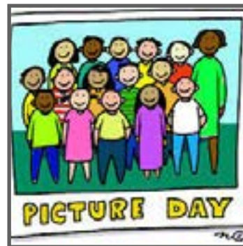
Picture Day Information