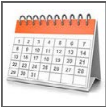
Bell Schedules & Calendars

CLICK ON AN IMAGE BELOW TO JUMP TO THAT PAGE