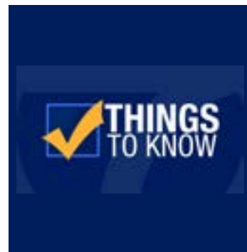
Things You Should Know