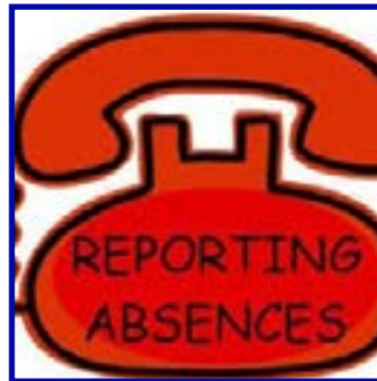
NEW! Report Absences Infinite Campus Portal