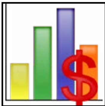
District 214 2023-24 Budget