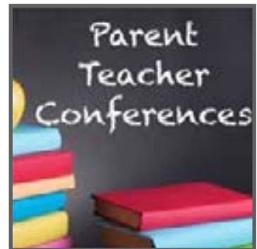
Parent Teacher Conferences