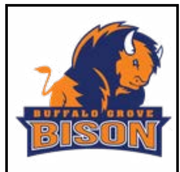
Bison Boosters News