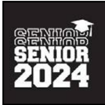
Class of 2024 Graduation News