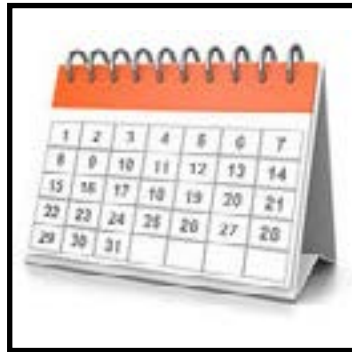
Blue & Orange Calendar and Bell Schedule