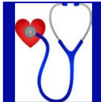
News from the Health Office