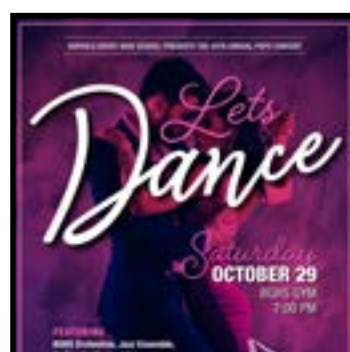
44th Annual Pops Concert