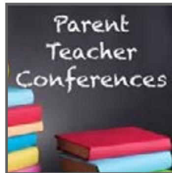
Parent Teacher Conferences