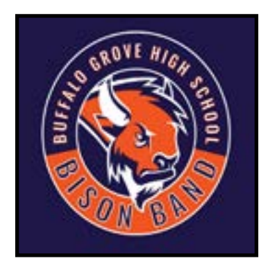
Bison Band News