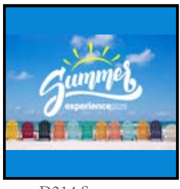
D214 Summer Experience 2025