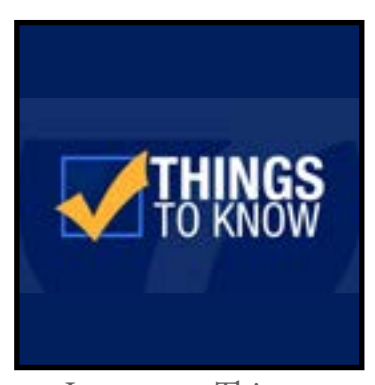
Important Things to Know