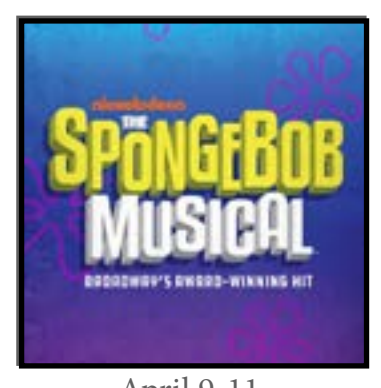
April 9-11 Sensory Friendly 4/12