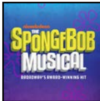
Musical Auditions February 3 & 4