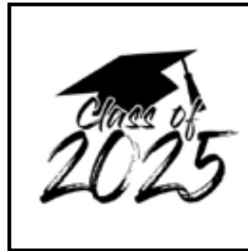
Class of 2025 Graduation News