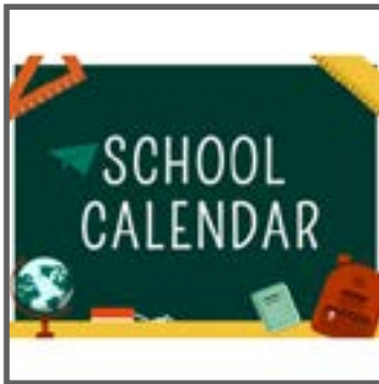
District 214 2024-25 & 2025-26 Calendars

CLICK ON AN IMAGE BELOW TO JUMP TO THAT PAGE