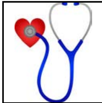
News from the Health Office