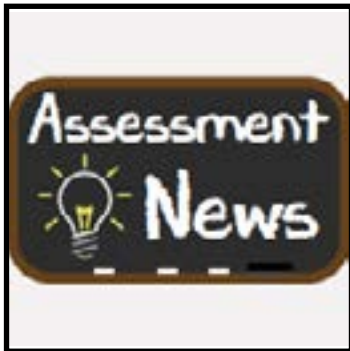
Assessment Center News