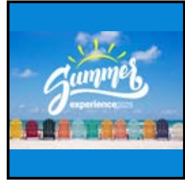
D214 Summer Experience 2025