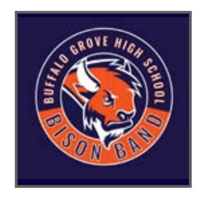
Bison Band News