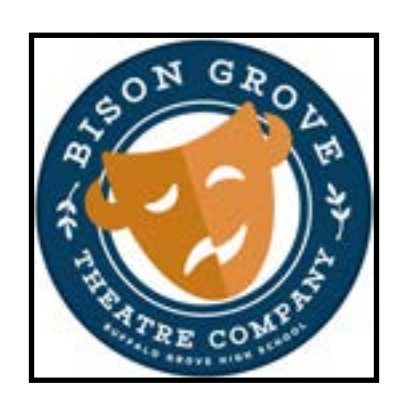
Fall Play Auditions