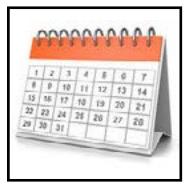
2024-25 Blue & Orange (A&B) Calendar