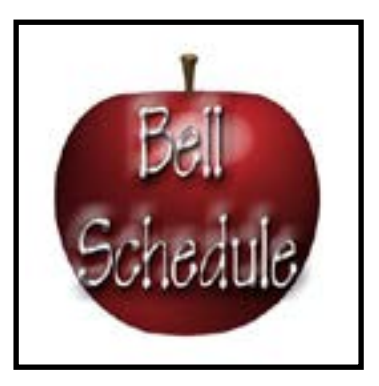
New Bell Schedule