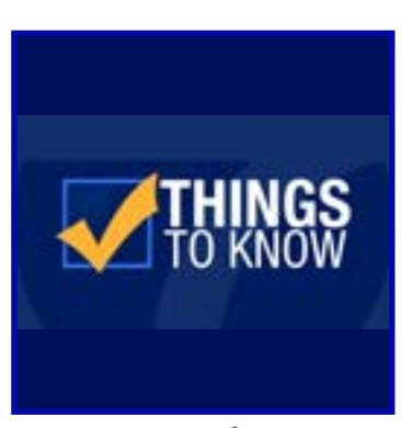
Reporting Absences, Lost & Found, Tip Line