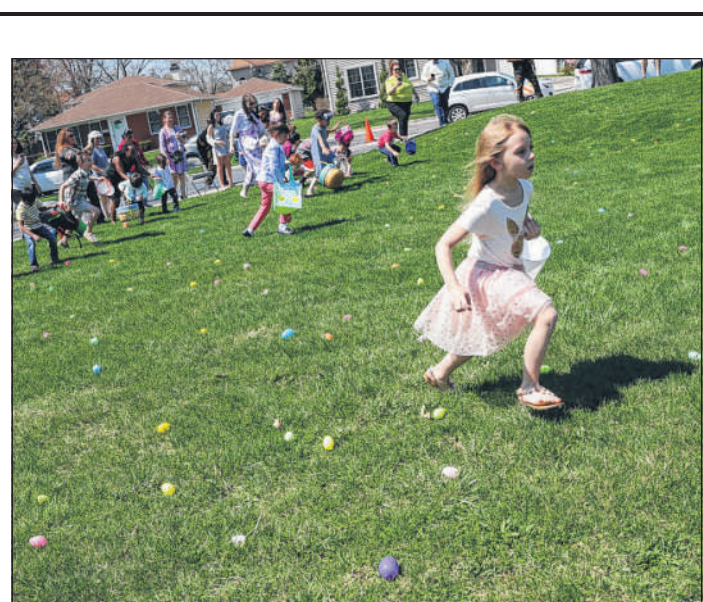
Many Easter egg hunts are divided by age group so everyone has a chance at finding eggs.

Egg-Citing Egg Hunt and Bunny Breakfast: 8-11 a.m. Saturday, April 9, Lakefront Park, 71 Nippersink Blvd., Fox Lake. The Bunny Breakfast will serve pancakes, eggs, sausage links, coffee, milk and juice, and is $9 per person, $8 for ages 62 and older, $6 for ages 4-10, free for ages 3 and under. The